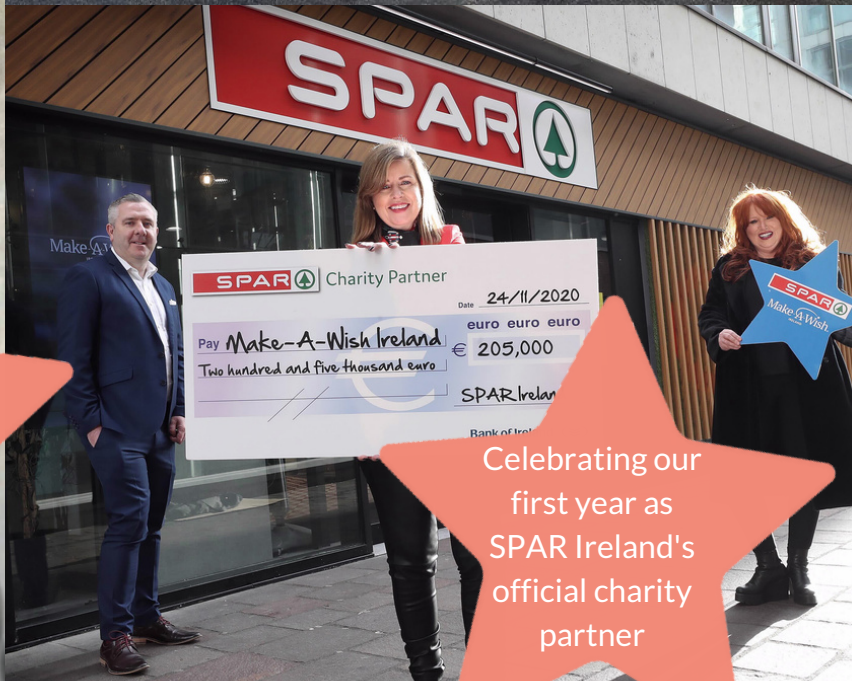
Celebrating our first year as SPAR Ireland's official charity partner