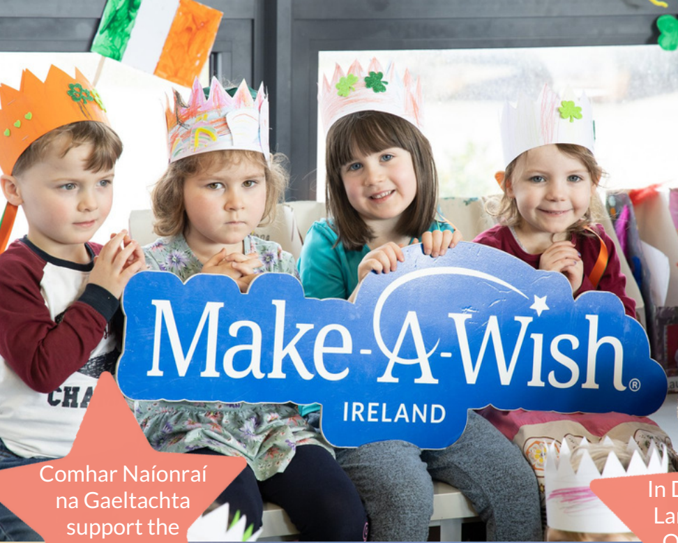
Comhar Naíonraí na Gaeltachta support the launch of Wish Day