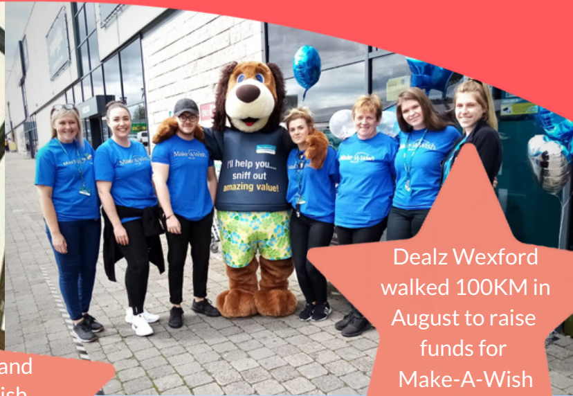
Dealz Wexford walked 100KM in August to raise funds for Make-A-Wish